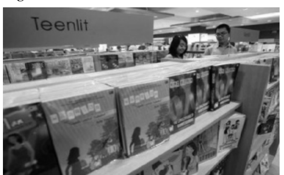
Figure 1: The Teenlit Section of Gramedia Bookstore

The imported teen literature presents characters and lifestyles of so-called permissive, hedonistic and highly consumptive urban teenagers. In these teenage novels, the presentation of teenagers who have been familiar with inter-sex kissing and partying is a quite common picture. The life of well-off teenagers, undoubtedly with a polished car for travelling, routinely going around cafes, proudly admiring Western pop artists, and habitually going shopping, is another commonplace characterisation of the imported, translated teenage novel. Just for example, the imported, translated teenlit works such as Menggaet Pangeran: Pulling Princess, The Calypso Chronicles by Tyne O Connell,<sup>14</sup> and Rahasia Menginap: Mates, Dates and Sleepover Secrets by Cathy Hopkins<sup>15</sup> present this kind of plot or story.