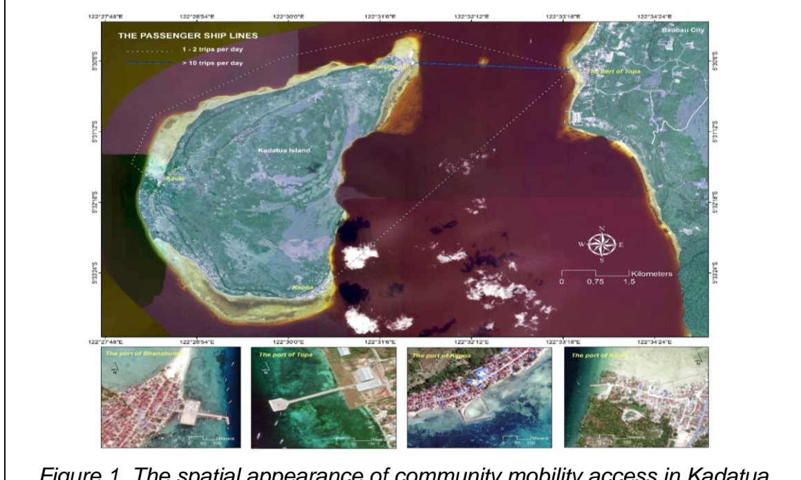
Figure 1. The spatial appearance of community mobility access in Kadatua Island

Access in and out of island communities, as per the results of interpretation of satellite imagery combined with field observations found that access in and out of the community of Kadatua Island, is from the Topa port of Baubau City to the Port of Bhanabungi (with shipping intensity more than 10 times a day), Kaofe and Kapoa ports of 1-2 times every day. The spatial appearance of Kadatua Island community mobility access through these 4 ports can be seen in Figure 1.