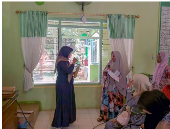
Figure 5. SADARI Training (Breast self-examination)

As a result of the SADARI training, participants are able to practice the SADARI steps correctly. Participants are able to recognize the condition of normal and abnormal breasts by checking themselves. When practicing SADARI, other participants will remind if something is wrong in practicing SADARI.