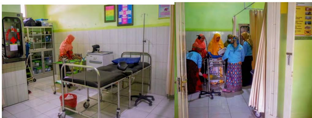
Figure 2. Preparation of VIA Inspection at Arjasa Health Center

through questionnaires and IVA and SADANIS examinations. The activity was carried out from July 26, 2019, to July 31, 2019. The first research and service activity was carried out at the Arjasa Community Health Center for one day to 40 respondents. The research team collected questionnaire data from respondents, while midwives conducted IVA and SADANIS examinations at the Arjasa Health Center. Questionnaire data contains an overview of reproductive health and risk factors for cervical and breast cancer. The respondents who had interviewed continued the IVA and SADANIS examination activities.