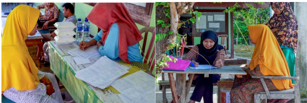
Figure 3. Data collection in Pajanangger Village

SADANIS examination at another time. Of the 100 respondents taken at the Arjasa Puskesmas and Pajanangger Village, as many as 90 respondents were able to undergo IVA and SADANIS examinations.