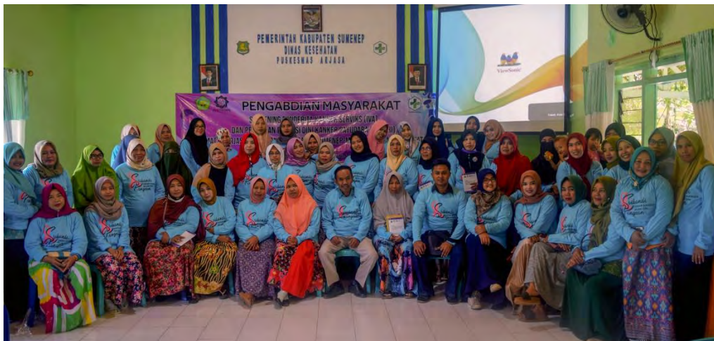
Figure 7. Research Team with Cadre Srikandi Kangean