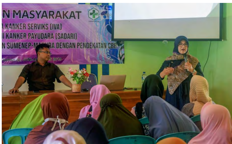
Figure 4. Health Education about Cervical and Breast Cancer

Health education about cervical and breast cancer was carried out by the research team at Arjasa Health Center by inviting 40 prospective cadre Kangean. In this health education activity, delivered related to cervical and breast cancer. The results of the health education obtained interactive discussions between participants and the research team. In the discussion, the participants actively conveyed the problems they experienced related to reproductive health and conducted a question and answer session with the research team. At the end of this activity produced participants who were able to explain risk factors, causes, early detection and management of cervical and breast cancer. Through this activity, awareness was also generated from participants to conduct early detection of cervical cancer with IVA and conduct breast self-examination for early detection of breast cancer. This is consistent with previous research in which increased knowledge about cervical and breast cancer can increase women's awareness to conduct early detection of IVA and SADARI.