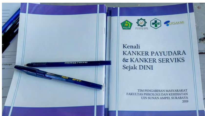
Figure 6. Book "Recognize Breast Cancer and Cervical Cancer Early"

Cadre Srikandi Kangean delivered material on cervical and breast cancer to the community in various community activities such as Posyandu, PKK activities, and community gathering. The role of cadre Srikandi Kangean is crucial in raising public awareness in carrying out early detection of cervical cancer with IVA and carrying out BSE. Cadre Srikandi Kangean from the local community facilitated the process of delivering cervical and breast cancer material following the conditions of the local community. This can be seen when cadres explain about cervical and breast cancer to the local community using the Kangean language more easily accepted and understood by the community.